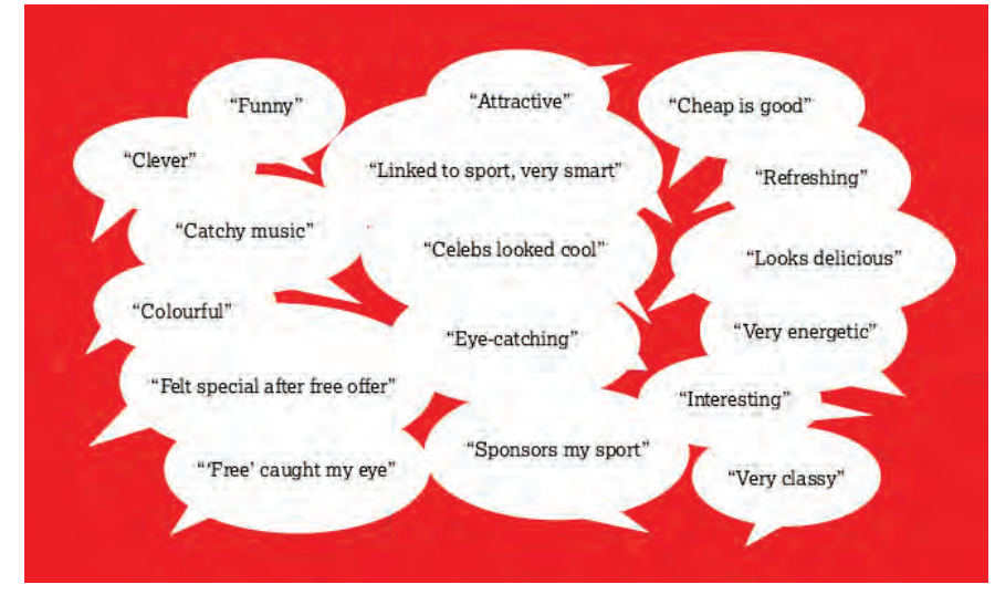
Appeal of alcohol marketing to young people

One in every four of the marketing practices involved a price promotion such as special offers, free alcohol or deep discounts. And of all the practices identified, the majority (60 per cent) were regarded as appealing to the young people, with humour being identified as one of the main bases of the appeal. Eight of the ten most appealing alcohol marketing practices were television advertisements.