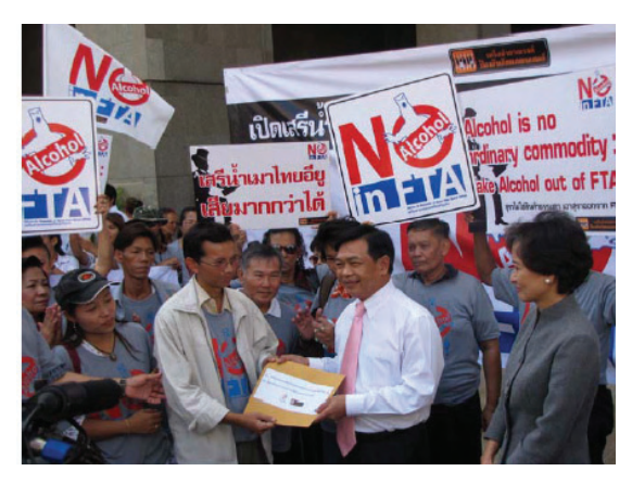
AAPP representatives submit open statement to Mr Alongkorn Pholabutr, Deputy Commerce Minister

the value and volume of alcohol imported from the EU would still be less than that produced by the domestic sector, the inclusion of alcohol in the Thai-EU FTA would significantly stimulate Thai alcohol consumption. However, with the decrease in duty from 60% to 0% a major leap in the alcohol beverage market is to be expected.