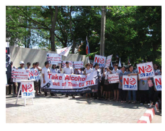
300 representatives of AAPP including university students

Komron Choodecha, AAPP representative claimed that whilst