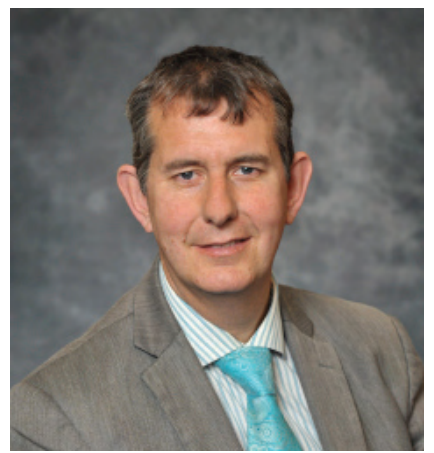
Mr Edwin Poots, Minister for Health, Northern Ireland

The key objectives of the conference included: